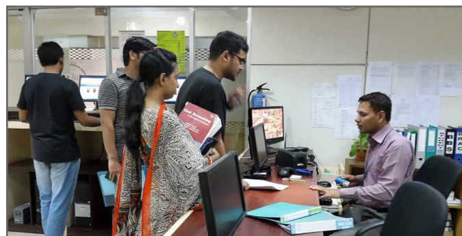
A photograph of BRAC University Library, showing a member of library staff assisting library users.

The process consisted of several stages over the years.